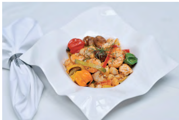
Thai Crusted Shrimp and Scallops served with pomegranate glaze and topped with a chiffonade of fresh fennel.