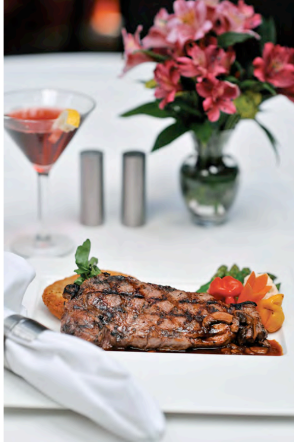
New York strip steak over mushroom bordelaise and a potato croquette.

fresh fennel. Another great dish recommended by the chef himself is the Herbed Chicken Breast, topped with sweet cranberries and crunchy walnuts, served on a bed of pungent goat cheese and sun-dried tomato raviolis, and finished with roasted butternut squash, baby spinach and creamy sage velouté sauce. Great steaks and pastas are always available as well. Chef Jeff's excellent food, served by a caring and efficient staff, ensures that the tables in this dining room will always be full! The service staff works as one big team, and it is a pleasure to experience. The end result reminds me of one of my all-time favorite restaurant sayings, "Good service means never having to ask for anything!"