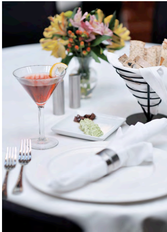
A distinctive basket of bread starts the meal.