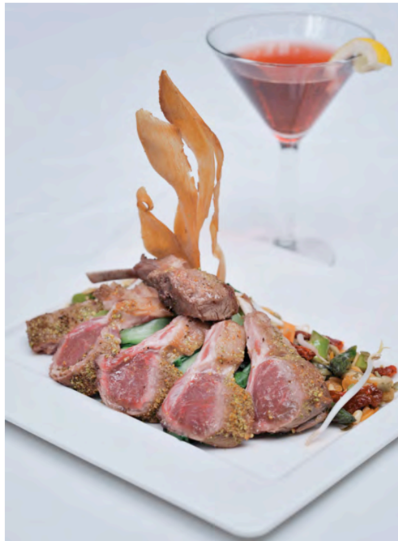
A stunning rack of veal, with classic breadcrumb coating, laid over a stir-fry of baby peppers, white beans, sprouts, spinach and fresh herbs.

Upon entering Bob's Place Restaurant, an overall feeling of peace and tranquility greets your senses. Featuring beautiful cherry wood and sleek modern architecture, you quickly get the feeling that everything is going to be excellent here. My guest and I were greeted by the hostess, and escorted to a lovely room complete with burning fireplace and soft lighting. The divine sounds of a busy restaurant enveloped us, and we were charmed by the gorgeous dining room. Sharply dressed servers sporting long-sleeve button-down shirts, black trousers, each rockin' a different tie, were whisking through the dining room. The anticipation of the dinner to come reminded me of some famous words we all love to hear, "The horses are in the starting gate, and they're off!"