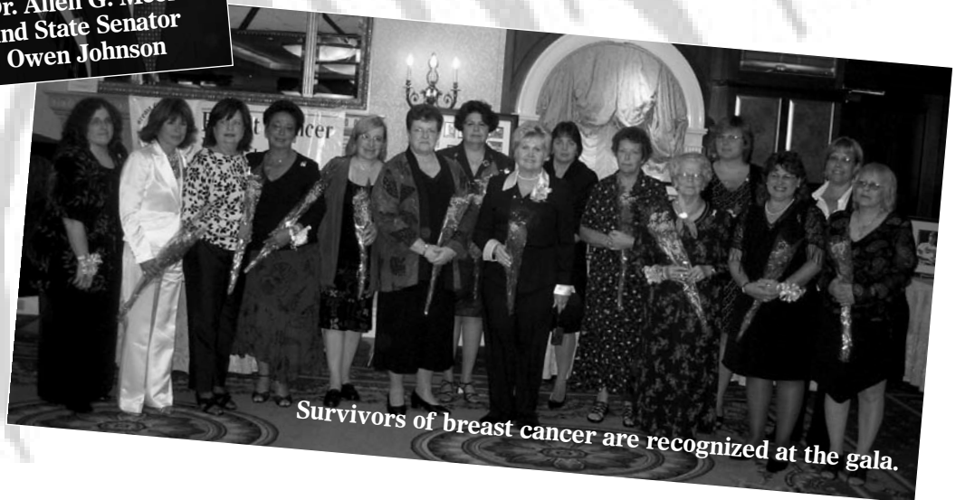
Survivors of breast cancer are recognized at the gala.