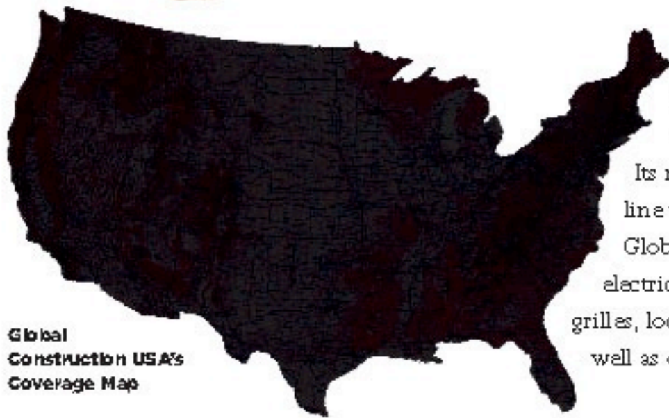
Global Construction USA's Coverage Map

Global's network provides plumbing, electrical, carpentry, glass, doors and grilles, locksmiths and disaster recovery, as well as other services.